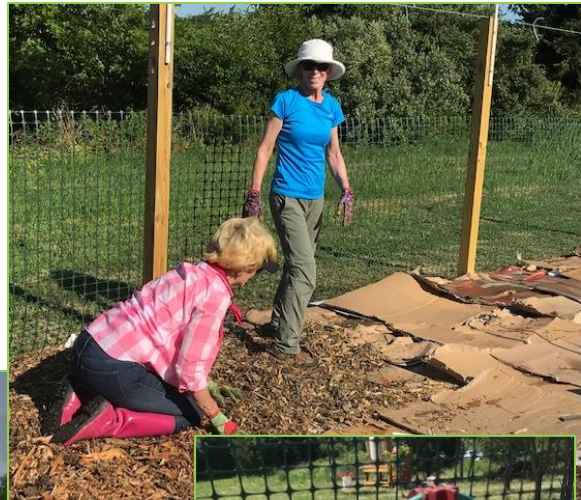
Weeds & critter guards