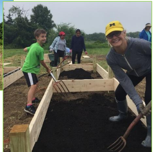
Building first beds