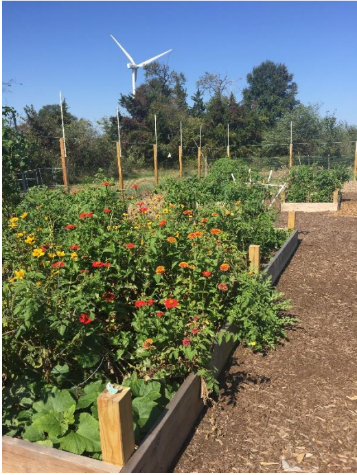
October 2019 Partial season celebration