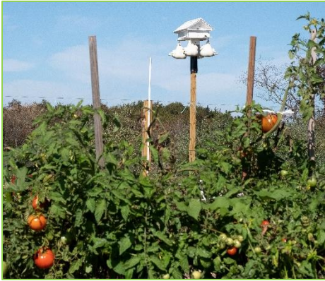
Purple Martin house