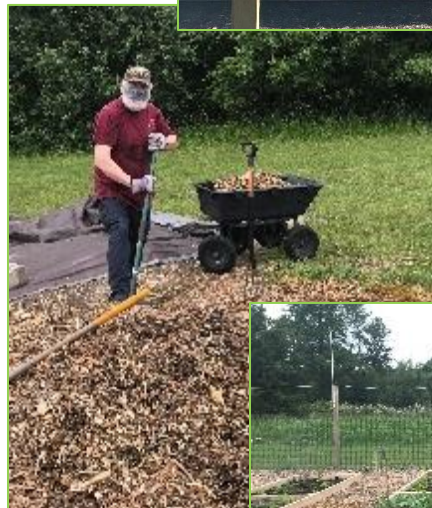
We've moved LOTS of mulch