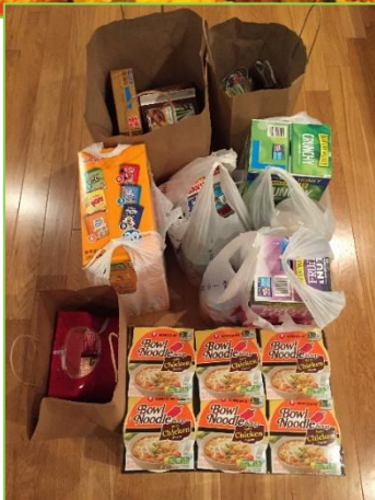
Examples of weekly donations