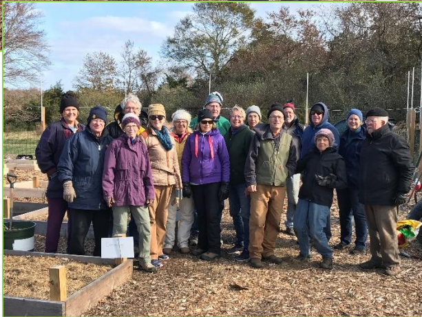
Adding more beds