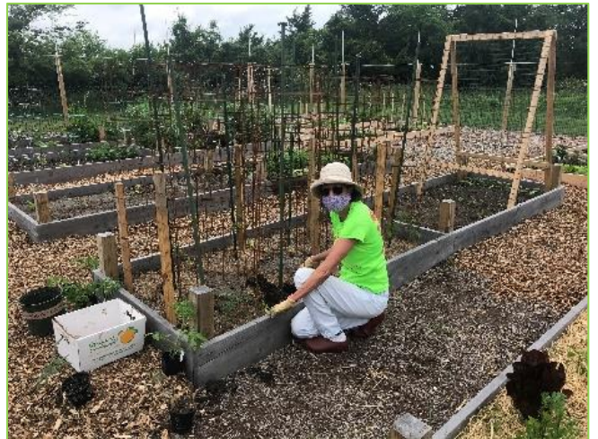
Planting beds for community donations