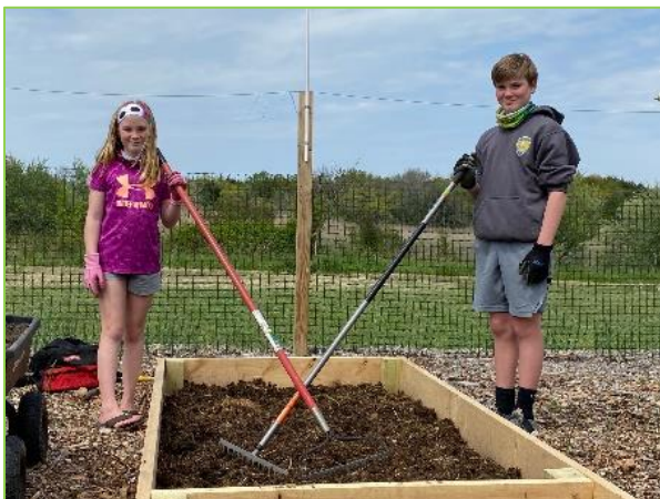
Two families rented beds in 2020