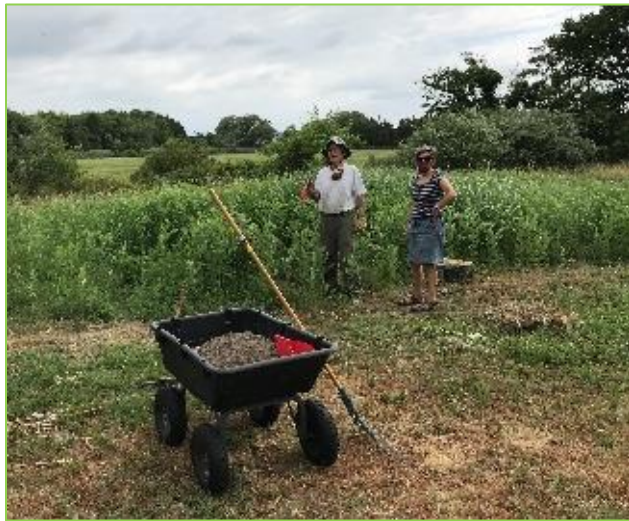
Native Gardens Outside the Fence