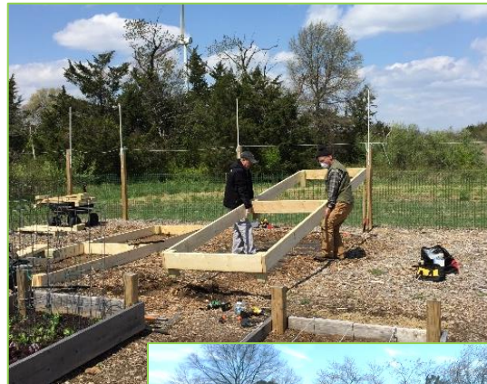
Social distance building

Twelve new gardeners and their families joined the LCG this spring. Due to the pandemic, each new gardener was given an individual orientation. By the end of April all the forty 4x8 garden beds were planted. We made our first donation to the Community Resource Center on April 28 th . Our weekly donations include organic produce as well as non-perishable food and masks.