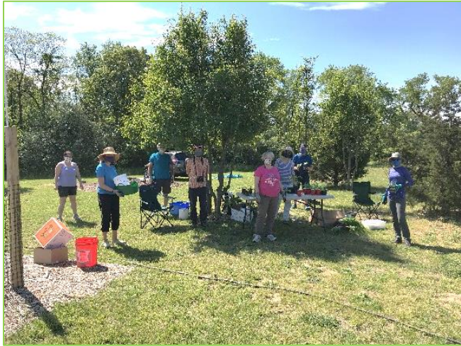
Plant Swap Day with social distancing