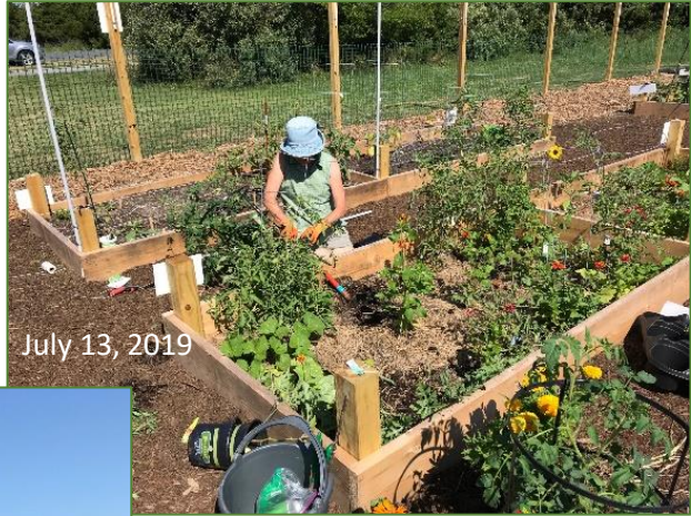
July 13, 2019