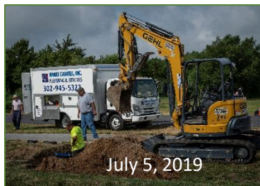
July 5, 2019