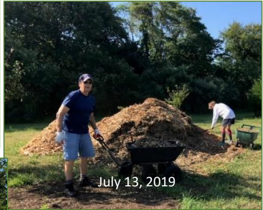
July 13, 2019