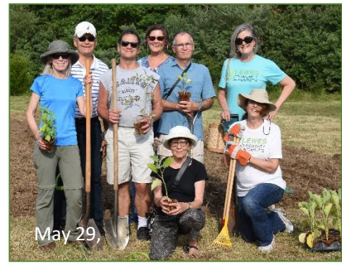
Ground breaking May 29, 2019