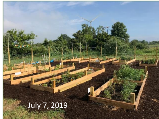
July 7, 2019