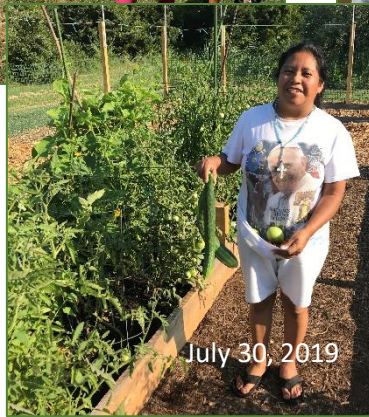
July 30, 2019