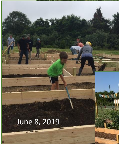
June 8, 2019