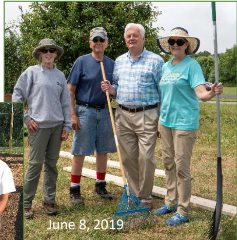
June 8, 2019