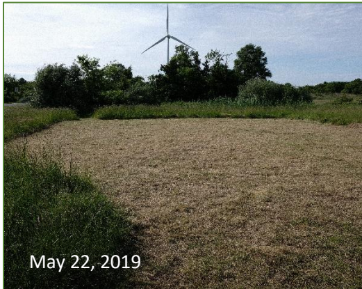
May 22, 2019

We started with a field between the Lewes Dog Park and University of Delaware wind turbine in the Great Marsh Park. We leased just under one acre of land from the city. After many mows we were able to plow two areas for our starter garden.