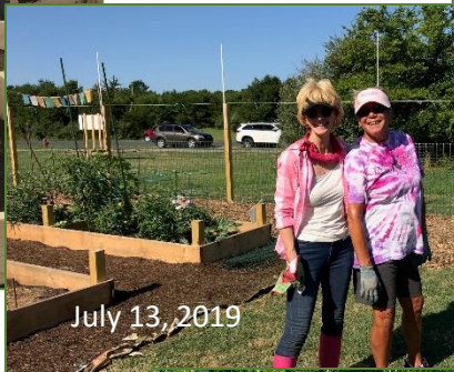
July 13, 2019