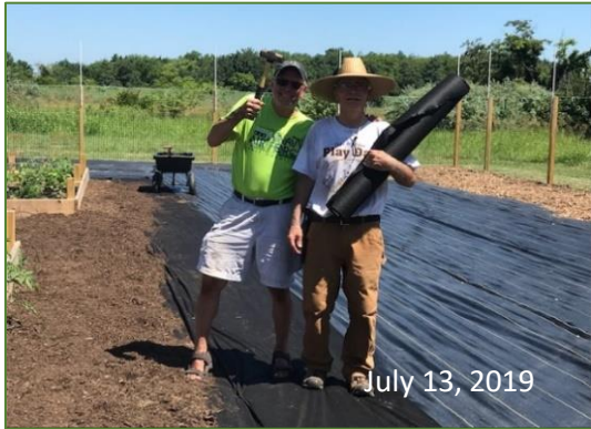
July 13, 2019