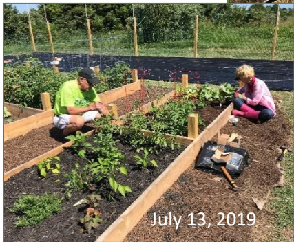
July 13, 2019