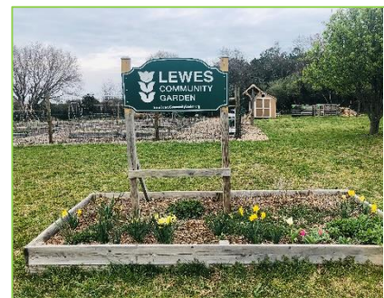
Our new sign